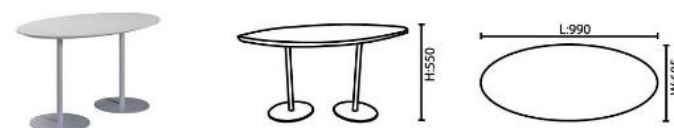
RAMMA Collaborative Table