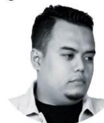
Sujaklosophy Product Designer

Creating a product design no more about an object. It's about experience. We generate a new opportunity for user to experience the brand, the emotion, the environment, the space and the ambiance. A strong commercial aspect pervaded user understanding in design and believe in good design to create a good product.