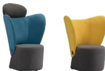
RAMMA High Single Sofa