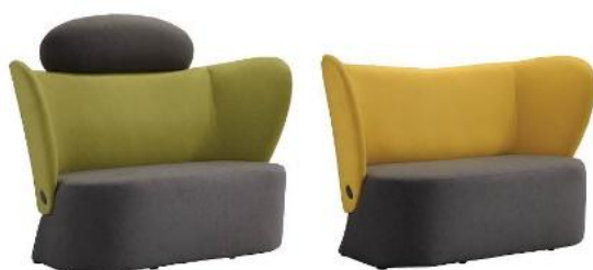
RAMMA High Double Sofa